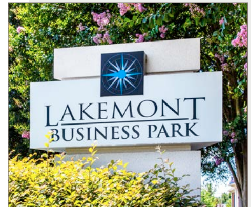
Lakemont Business Park Monument Sign

Lakemont Business Park is a ± 1.15 million SF master-planned development located in the Fort Mill Township of York County, SC. The park is conveniently located along I-77 and is accessed via Lakemont Boulevard, which has a signalized traffic light at Carowinds Boulevard. The first building in the business park was completed in October of 2015, and it is a 164,576 SF build-to-suit developed by The Keith Corporation for Broad River Furniture. A second site has been sold to Oxco, a light manufacturer, and they have plans to develop a 200,000+ SF building. The remaining sites are available for purchase or build-to-suit development.